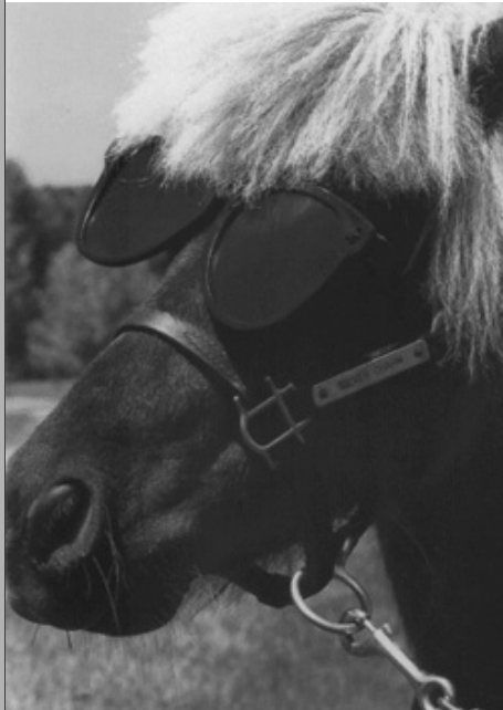
Little Silver Charm

I've been very busy lately. What with practicing my soccer moves and working on my memoirs I barely have time to keep up with my fan mail. I'm more popular than ever now that my photograph has been in People magazine. A beautiful miniature mare named Champagne Dreamer even sent me a pin-up picture of herself. Michael tacked it up in my run-in shed next to my centerfold of Azeri from the Blood Horse. Here's looking at you, girls.