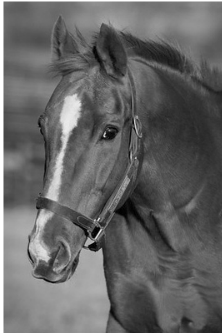
The Wicked North

Tickets are $50 & $25 for Old Friends members and shareholders.