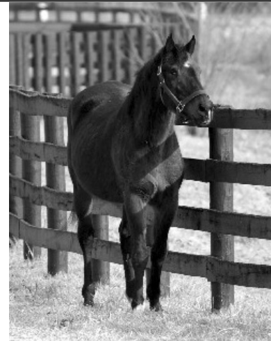
Clever Alilemont